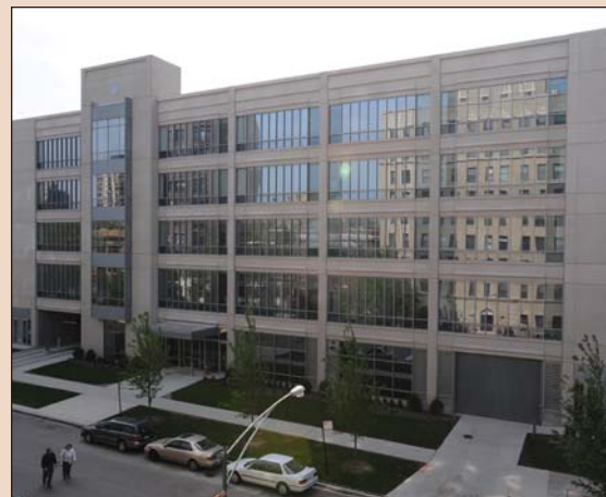
Catholic Theological Union, Chicago

A national Catholic organization providing education for religious women and men engaged in the ministry of initial and life-long formation for the sake of mission in the Church and the world